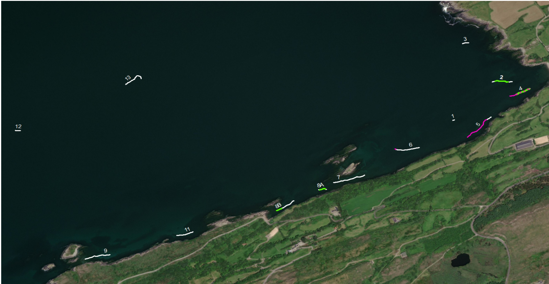
Figure 3.1 MERC survey – location of video recording transects 29.4.2022 Green transects = seagrass Zostera marina recorded Pink transect = recording of live maerl