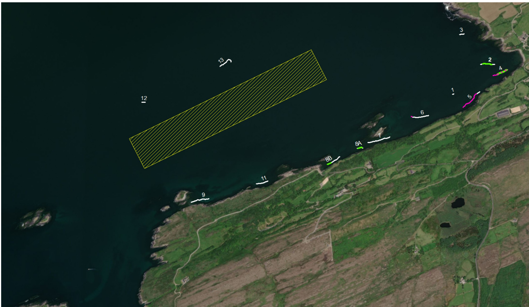
Figure 3.2 MERC survey - location of video transects / proposed aquaculture site T05/590 Green transects = seagrass Zostera marina recorded Pink transect = recording of live maerl